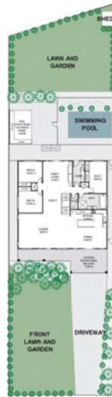
GENERAL PLAN MAIN LIVING LEVEL AND SITE PLAN (NOT TO SAME SCALE)

APPROX INTERNAL AREA IN SQM LOWER LEVEL - 76 MIDDLE LEVEL - 193 UPPER LEVEL 61.4 TOTAL - 330.4 LAND SIZE - 1005 SQM