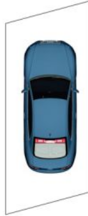
SINGLE PARKING SPACE 2.6X5.4