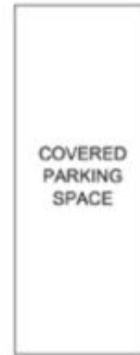
COVERED PARKING SPACE