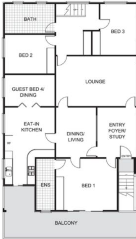
LEVEL 1 - MAIN LIVING