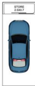
SECURE BASEMENT PARKING 2.5X5.5