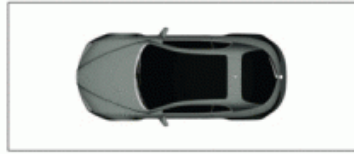
SINGLE PARKING SPACE 6.1X2.5